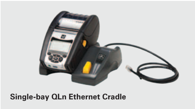
Single-bay QLn Ethernet Cradle